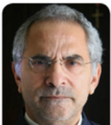
Dr. José Ramos Horta AC Nobel Peace Prize Laureate