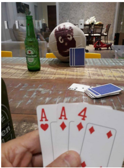
What you do when the floods come in!