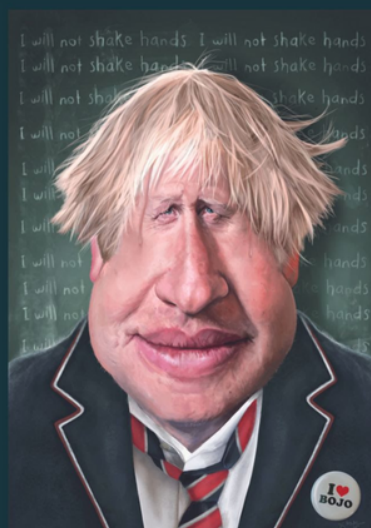
Boris Johnson

Book your tickets by 21 Feb at https://www.trybooking.com/BWWWR