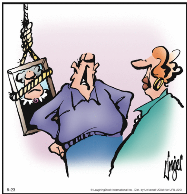
“You told me to hang your mother’s picture in the hallway.”